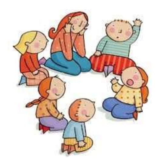
Circle games will help us get to know each other.

We will carefully explain what happens at the end of the day.